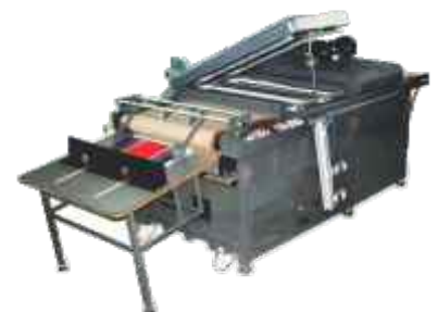
STALLION AL40400IIC12 for Planeta series of 102 presses