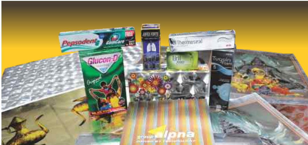
UV Print on difficult substrates like - Metalized Polyester, PP, Lenticular, etc.