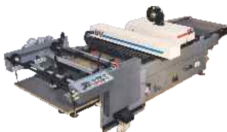
AL30300C9XT-UV Dryer suitable for Heidelberg SORM or equivalent press