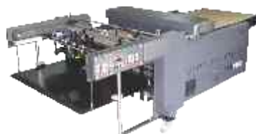
STALLION AL40300CXT9 for Planeta series of 102 presses