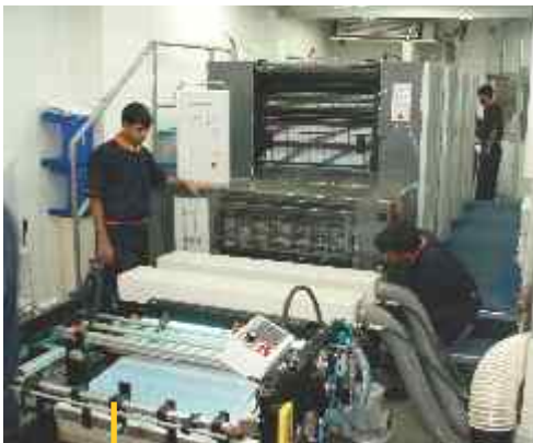
AL304002C6XT- Compact UV drier with two UV lamps and Class II cool UV system for Heidelberg SM74