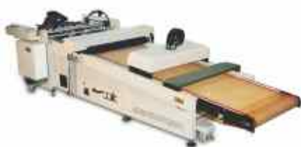
AL36300C12XT-UV Dryer suitable for Heidelberg SOR or equivalent press