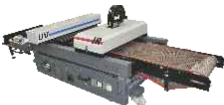
AL30300C9i-UV Dryer suitable for Heidelberg SORM or equivalent press